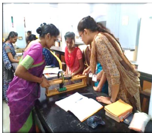
In- House Training on “Absolute determination of M and BH and BG- figure of merit for charge” organised by the Department of Physics from 19 th to 22 nd December 2022