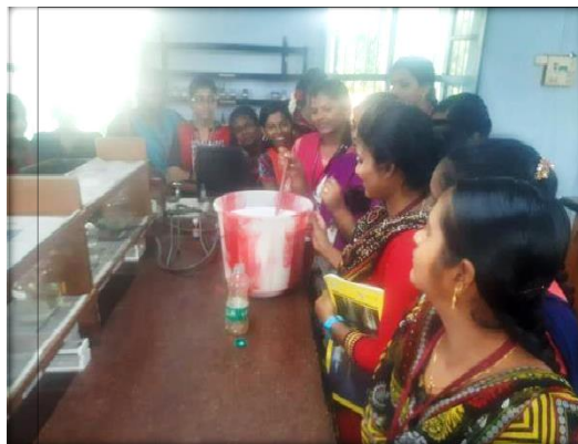
In- House Training on “Preparation of Household articles” organised by the Department of Chemistry on 21 st December 2022