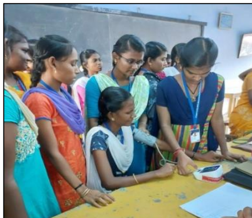
In- House Training on “Separate blood cells, Measure the heart beat and measure the blood pressure” organised by the Department of Zoology 22 nd December 2022