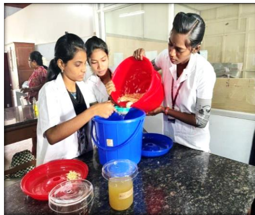
In- House Training on “Preparation of biofertilizer” organised by the Department of Botany from 19 th to 21 st December 2022