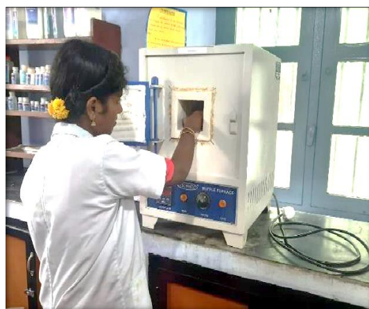
In- House Training on “Preparation of Nanoparticles” organised by the Department of Chemistry on 20 th December 2022