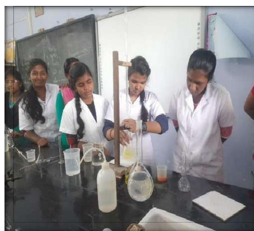
In- House Training on “Argentometric Titration” organised by the Department of Chemistry 21 st December 2022