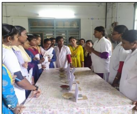
In- House Training on “Millet-based tiffin recipes” organised by the Department of Botany on 28 th July 2023