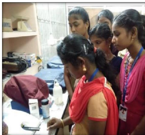
In- House Training on “Basic Skills in Biological Sciences” organised by the Department of Botany from 19 th December 2022