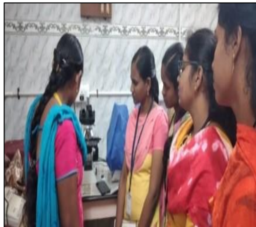
In- House Training on “Measure the Diameter of the Cell” organised by the Department of Zoology on 21 st December 2022