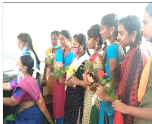
In- House Training on “Digitalization of Campus Flora” organised by the Department of Botany from 14 th to 18 th December 2021