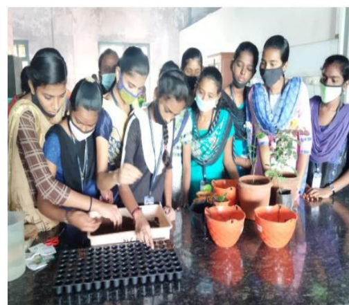
In- House Training on “Horticultural Techniques” organised by the Department of Botany from 14 th to 18 th December 2021