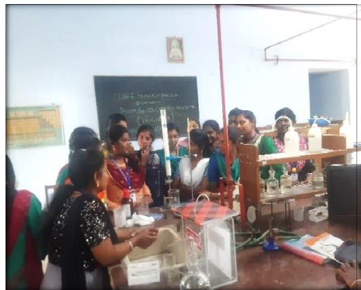
In- House Training on “Chromatographic Techniques” organised by the Department of Chemistry on 22 nd December 2022