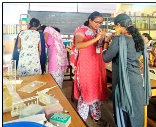
In- House Training on “Biotechnology experiments” organised by the Department of Zoology from 20 st December 2022