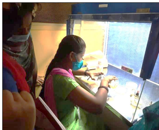
In- House Training on “Basic clinical analysis” organised by the Department of Zoology from 13 th to 17 th December 2021