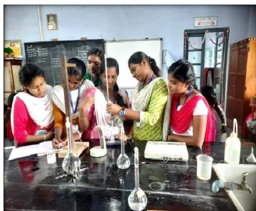
In- House Training on “Conductometric Titration” organised by the Department of Chemistry on 22 nd December 2022