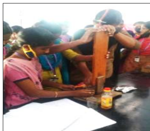
In- House Training on “Extraction and Analysis” organised by the Department of Botany from 14 th to 18 th December 2021