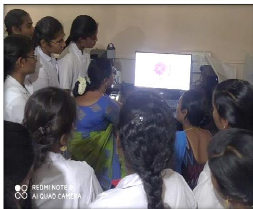
In- House Training on “Essential steps in plant microtechniques: From preparation to observation” organised by the Department of Botany from 19 th to 20 th December 2022