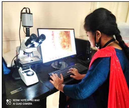
In- House Training on “Histological Techniques” organised by the Department of Botany from 14 th to 18 th December 2021