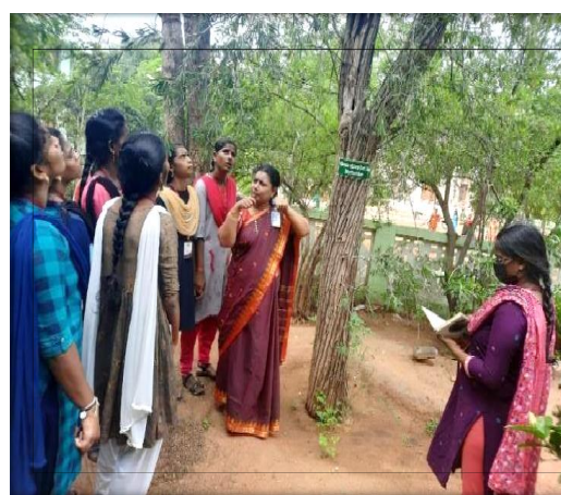
In- House Training on “Herbarium Techniques” organised by the Department of Botany on 21 st December 2022