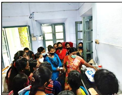
In- House Training on “Estimation of glucose, cholesterol, hemoglobin and protein in blood sample” organised by the Department of Chemistry from 14 th , 16 th to 17 th December 2021