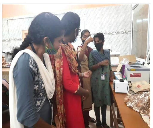
In- House Training on “Isolation and Separation of DNA” organised by the Department of Zoology from 15 th to 18 th December 2021