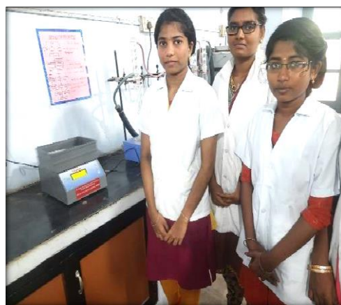
In- House Training on “Determination of BOD, COD and soil quality parameters” organised by the Department of Chemistry on 19 th December 2022