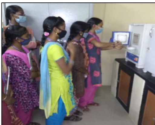
In- House Training on “Metal Analysis” organised by the Department of Botany from 14 th to 18 th December 2021