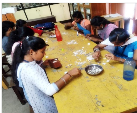
In- House Training on “Unveiling the Economic Potential of Molluscs: From Tide to Trade” organised by the Department of Zoology on 27 th August 2024