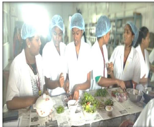
In- House Training on “Bakery products preparation” organised by the Department of Botany from 21 st to 22 nd December 2022