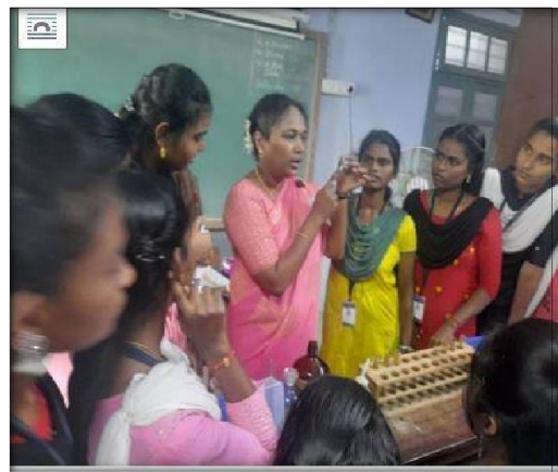
In- House Training on “Extraction and estimation of DNA, Bioinformatics tools – BLAST, FASTA AND RASMOL” organised by the Department of Botany from 20 th to 22 nd December 2022