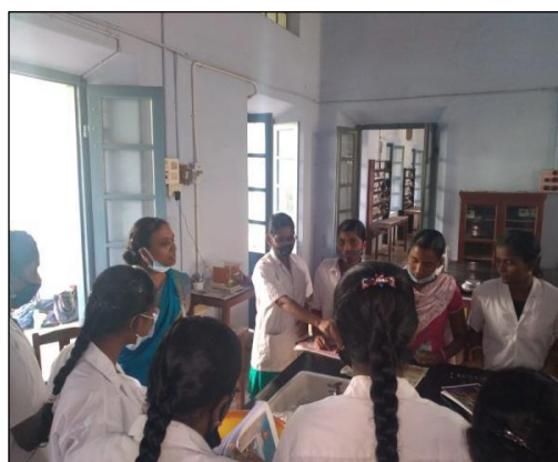
In- House Training on “Analysis of carbon, nitrogen, phosphorous, zinc and calcium in soil” organised by the Department of Chemistry from 14 th to 15 th December 2021